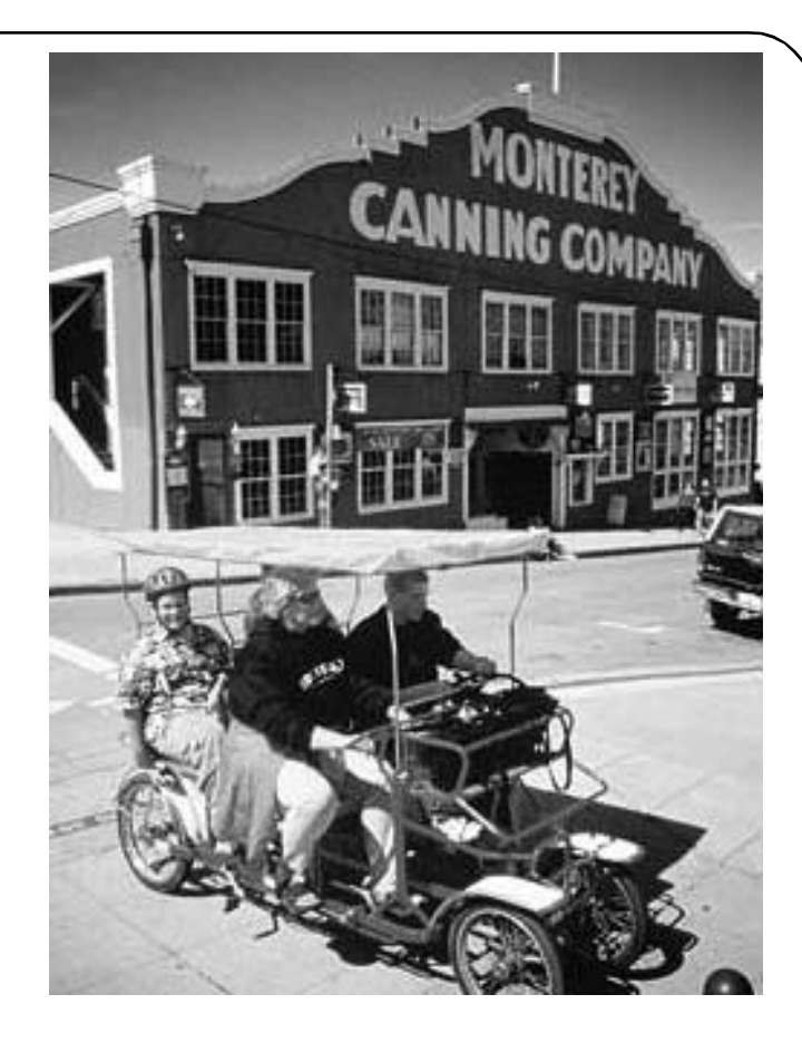
Exploring "Cannery Row" is just one of the many attractions waiting for you at our annual meeting "Oceans of Shellfish" in Monterey, CA.